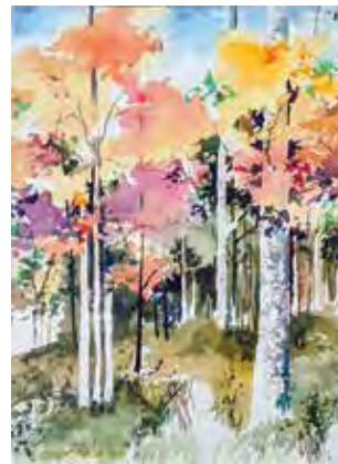
Ohio Watercolor Society and the Ohio Watercolor Society. $124 / 4 sessions