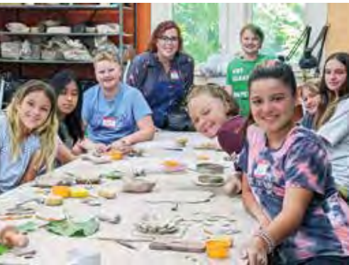
Summer fun in the Ceramics Studio

Reg by 6/12 or 7/17 $154 / $139 (member)